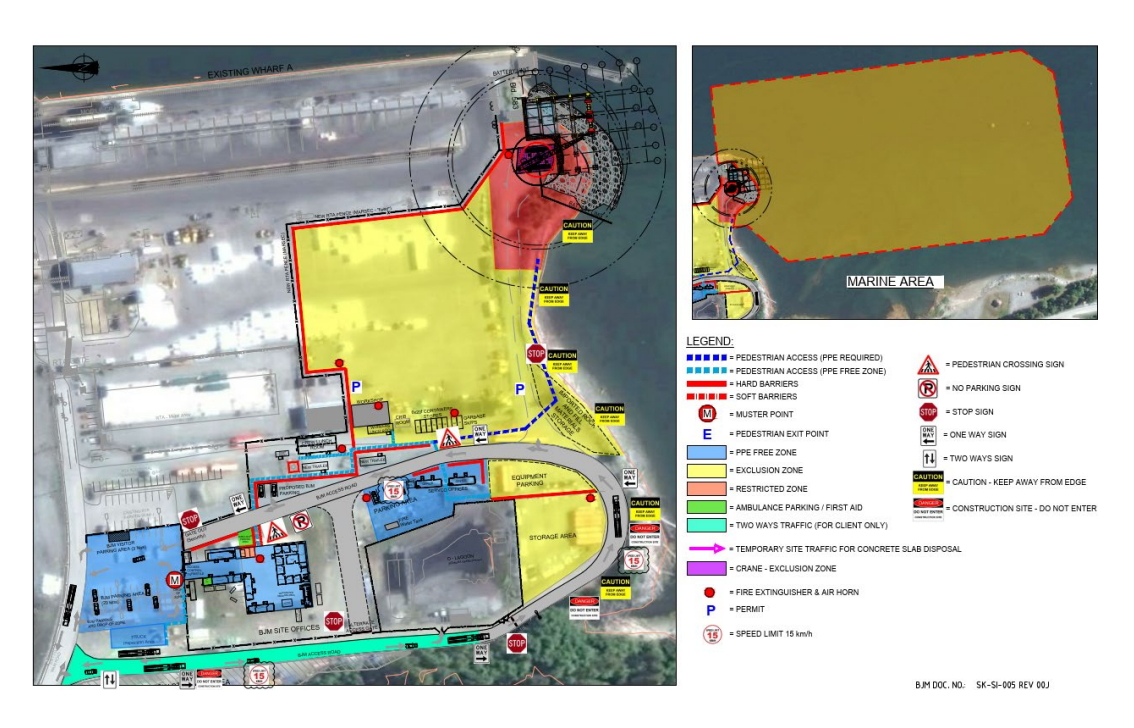
Figure 1. RT Terminal A Site Lay-out