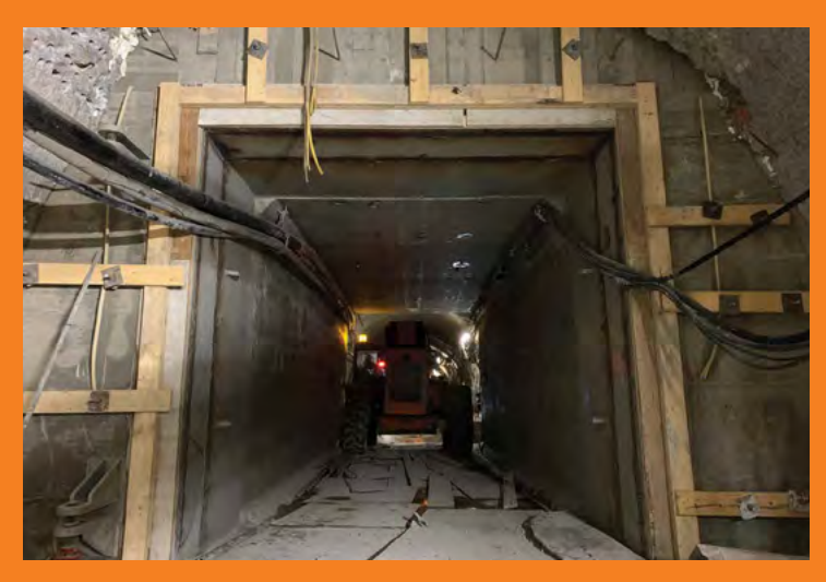
2600 Plug and the commencement of construction of the Horetzky Plug.

Landing . This plug will be 12m long and horseshoe shaped 7m wide and 7m tall. Both plugs are made of concrete and will have a 3m by 3m steel door that will allow equipment access for future maintenance. The plugs include drainpipes that can be opened by valves to empty the tunnel when and if access is required at a later date. It takes six to eight weeks to construct a plug!