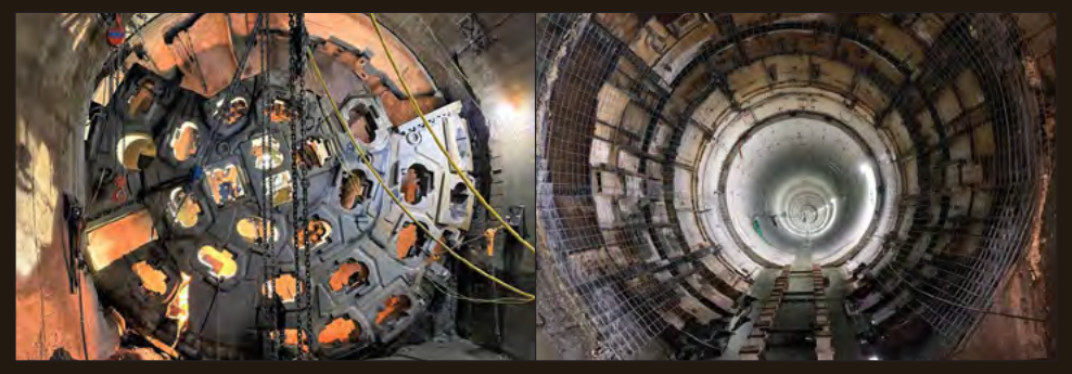
Removal of the cutter head of the TBM, TBM Shield will be incorporated into tunnel lining.

When all the services are removed, workers will finish cleaning the tunnel and perform a final inspection before filling the tunnel with water in the summer of 2022.