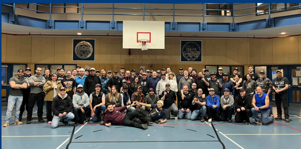
Diavik's final underground mining crew poses for a photo in the gymnasium on 24 March.

Diavik's end of production in March came with plenty of milestones to mark. These photos capture some of the final crews and team members to ever mine in Diavik's underground.