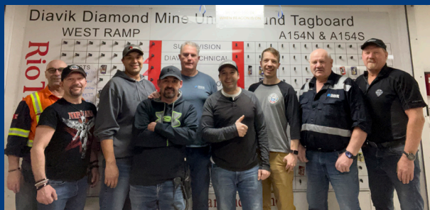
Crew leaders gather for a photo following our final production blast.