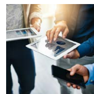
Glass and Textile Fiberglass