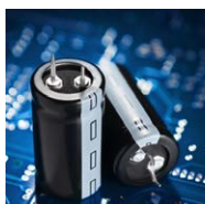
Batteries and Capacitors