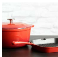
Ceramics, Enamels, and Glazes