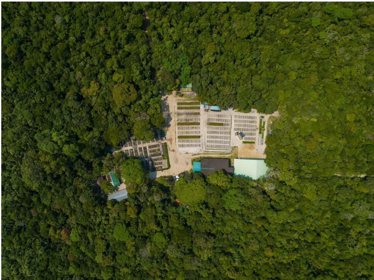
Tree nursery within the conservation zone.

QMM extracts ilmenite, zircon, and monazite along the coastlines of southeast Madagascar. The mined area is rehabilitated with fast-growing tree species using previously stored topsoil.